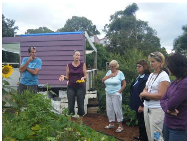
Transition Town Gardeners learning from other people's gardening experiences in Booral, May 2010

Seed saving day preparing seeds etc; if anyone has any seeds to contribute to the seed bank please bring them along, as we need to keep the stock fresh